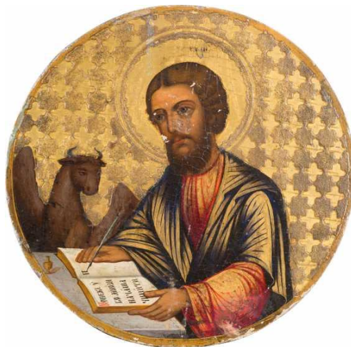
The evangelist Luke [as icon].