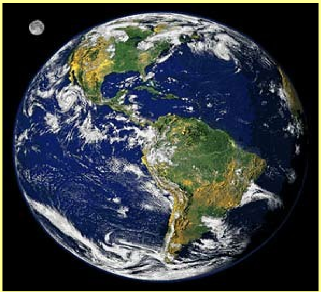
The earth: two imaginary animals facing each other, as it were

It is estimated that the Earth took 4.5 billion years to form. Before that, it was still a liquid mass. The moon has very high mountains, especially on the far side with many caves and caverns. It is said to consist of 85% craters. The moon also consists of iron and regolith. The bottom of the moon is yellow, grayish.