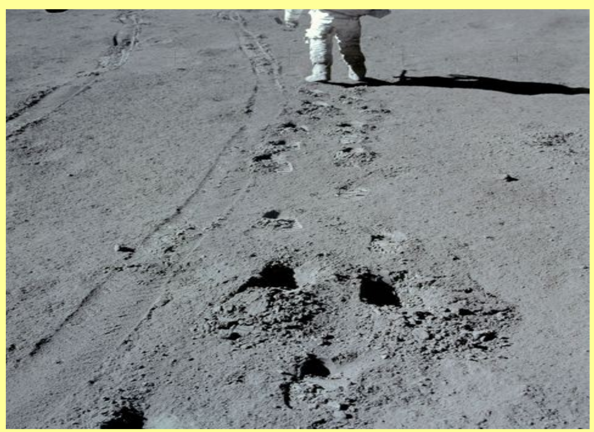
Could these have been wheel tracks on the moon? What do the "made" holes mean?