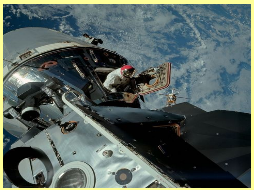
In orbit, an astronaut takes a look outside the command module