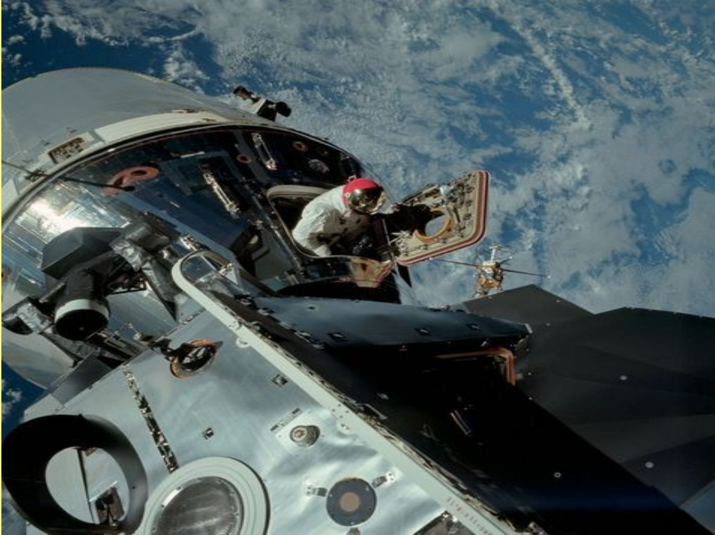
In orbit, an astronaut takes a look outside the command module