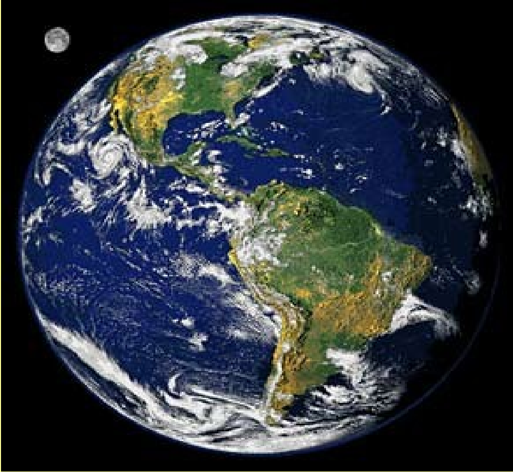
The earth: two imaginary animals facing each other, as it were

It is estimated that the Earth took 4.5 billion years to form. Before that, it was still a liquid mass. The moon has very high mountains, especially on the far side with many caves and caverns. It is said to consist of 85% craters. The moon also consists of iron and regolith. The bottom of the moon is yellow, grayish.