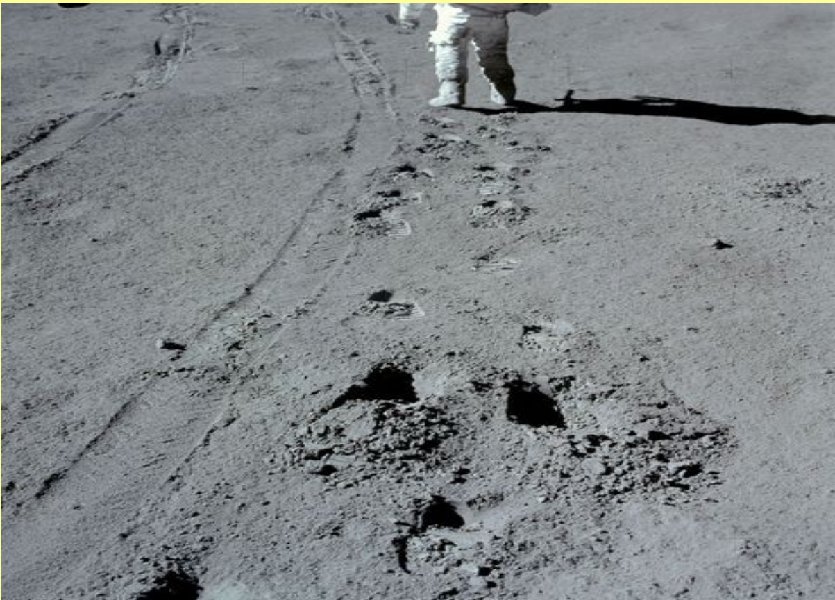
Could these have been wheel tracks on the moon? What do the "made" holes mean?