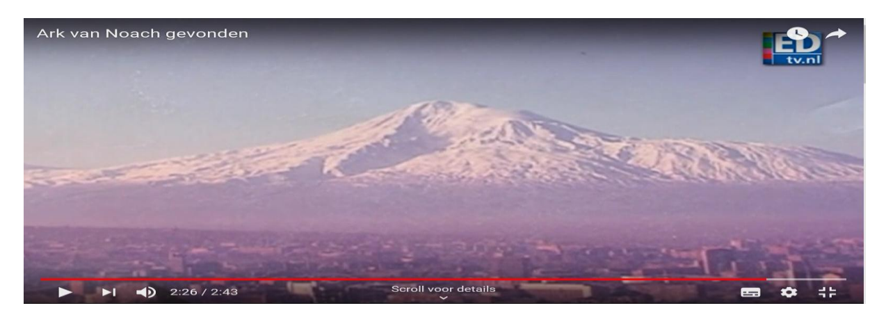
The mountain ARARAT in the former ARMENIA

The Lord in Jakob Lorber: "I tell you that we are all actually like Noah. The world with its lies and deceit and all the resulting temptations is the everlasting flood. In order not to be devoured by this, we have to execute the assignment for building the ark as diligently as possible. This ark is the confirmation of the life of our soul to thereby preserve the divine, spiritual life in the soul and ultimately to form it completely." GGJ3-43: 9