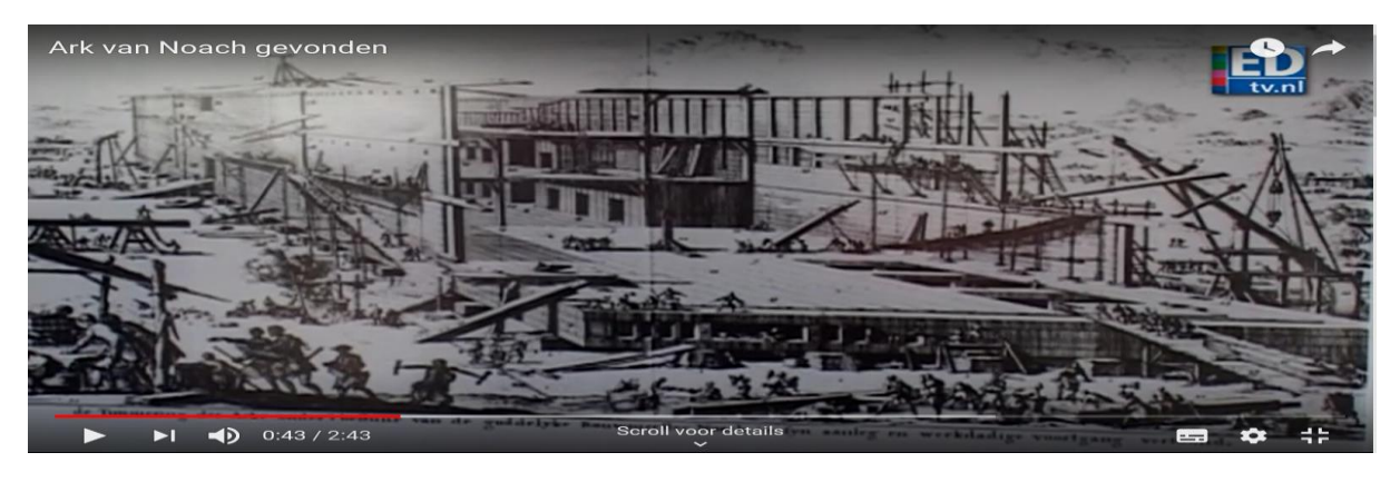
Start with the construction of the Ark of Noah, 1656-20 years = 1636 years A. Adam

At the foot of the Ararat, in a deserted barracks, the Turkish Pamirs, men in camouflage suits, who were abandoned by the Turkish army, left the complex. A little further on, the slope of the mountain range Ararat, which is lonely above the landscape, begins with its inhospitable peaks which, according to tradition would still be Noah's Ark covered by more than four thousand years of mud, snow and ice.