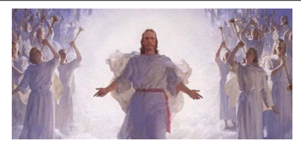
By Wilfried Schlätz [Short excerpt]

The LORD shows us in his New Revelation through his writer Jakob Lorber that not only all the planets of our solar system except Pluto, not just the planetary suns that resemble our Sun, but also the surrounding suns (a diameter of 1 light-year and central stars of spiral nebulae) and the largest suns (with a diameter of 1 million: 106 light years, and a central star with millions of galaxies) are inhabited by people of our material type.