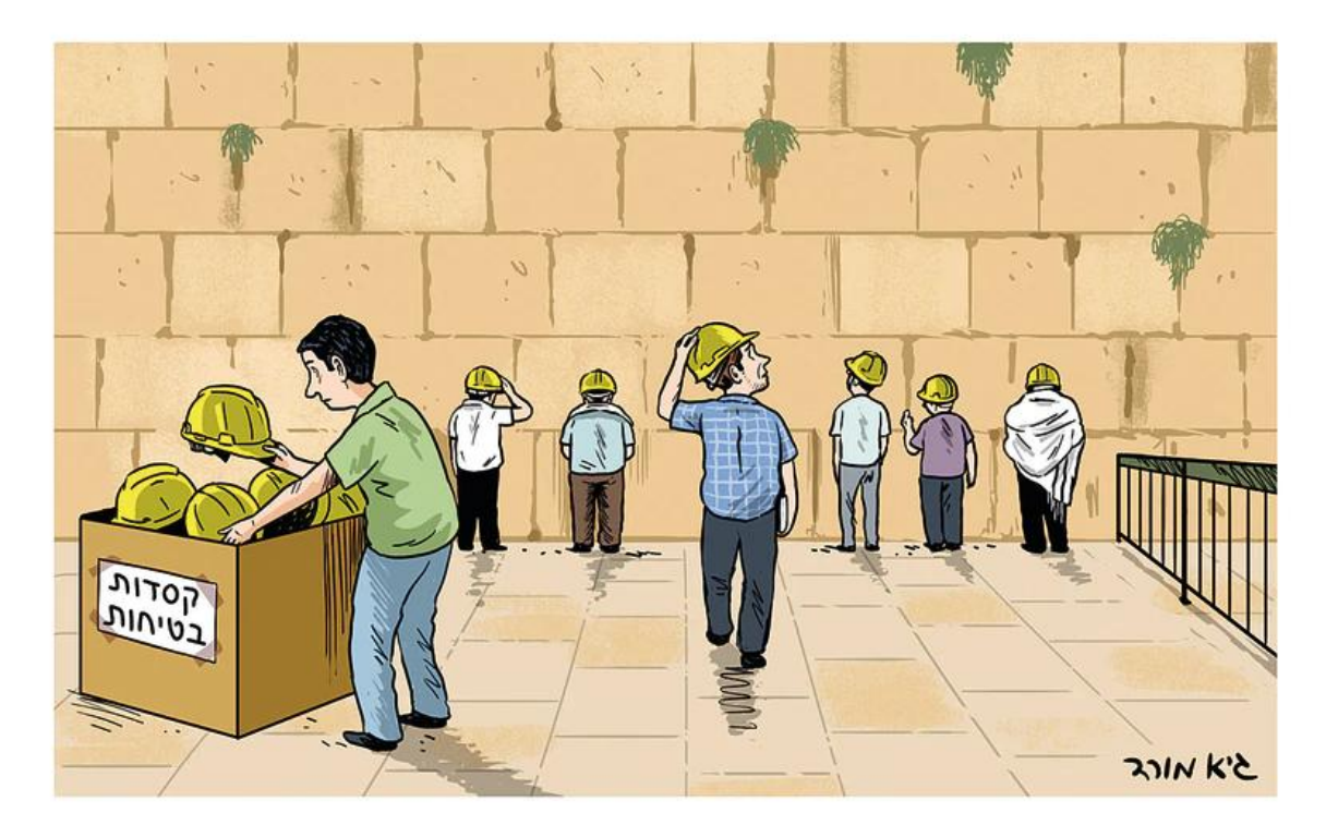
Does the Wailing Wall crumble in Jerusalem?