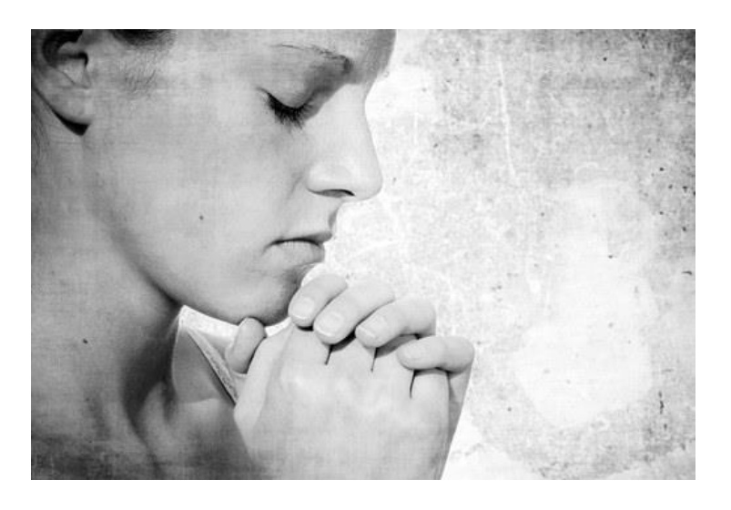
(shortened) By Klaus Opitz